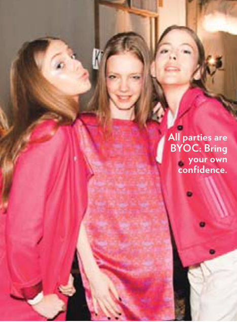
All parties are BYOC: Bring your own confidence.